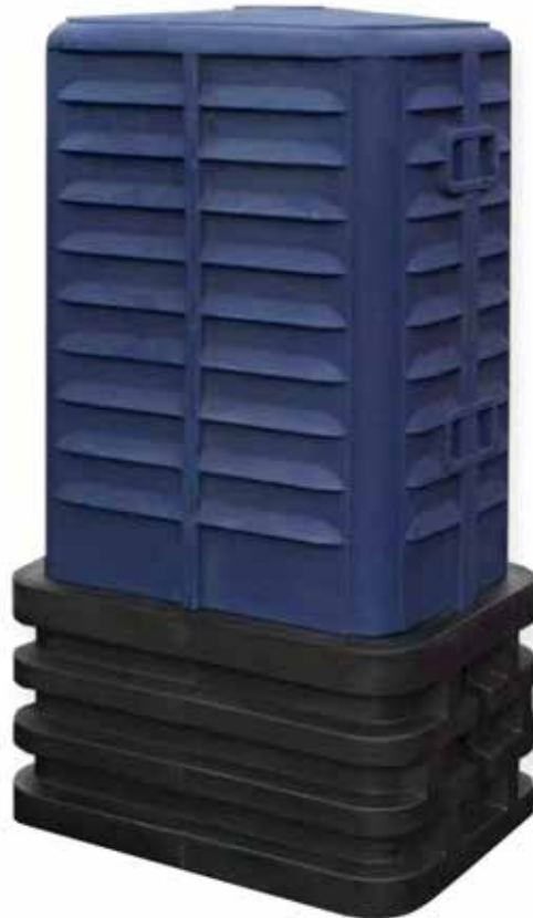
SPH1420 (Medium Blue)