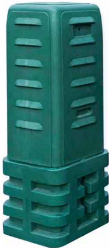
SPH1212 (Dark Green)