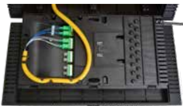
Right side drop

Left or right main cable and drop cable entry provides maximum flexibility in aerial applications and avoids the need to procure and install additional hardware.