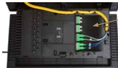
Left side drop

Bi-Directional terminal panel door allows drop connections from either side without tools, just by unsnapping and flipping the panel door.